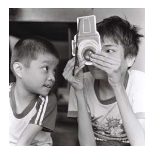
Thank you from the bottom of my heart. Tận đáy lòng mình, tôi xin chân thành cảm ơn tất cả các quý vị.

The lotus is seen within the Vietnamese culture as a symbol of purity, strength and endurance, and as a reflection of their own ability to stay strong in the midst of adversity while maintaining their unique traditions.